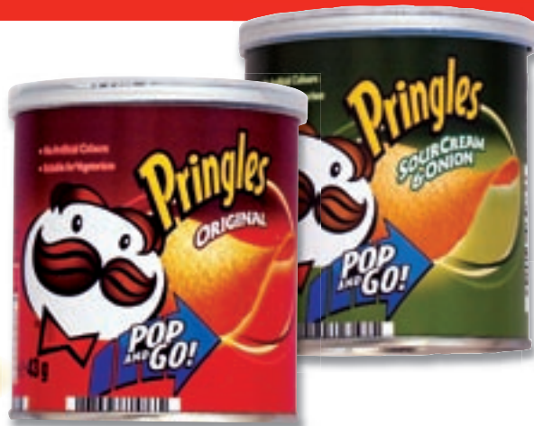
Pringles 43g Original (gluten free). Sour Cream and Onion. (Paprika flavour available on some flights) £1.40 • €2.00 • CHF3.50 each