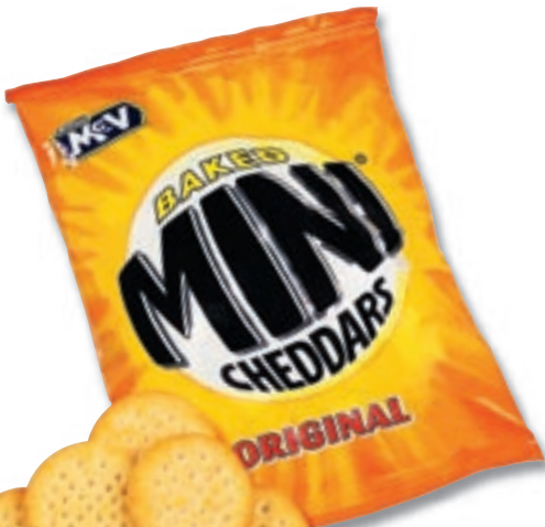
Mini Cheddars 50g £1.00 • €1.50 • CHF2.50