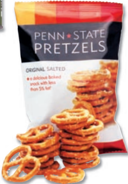
Penn State Pretzels 30g Original (product may vary). £1.00 • €1.50 • CHF2.50