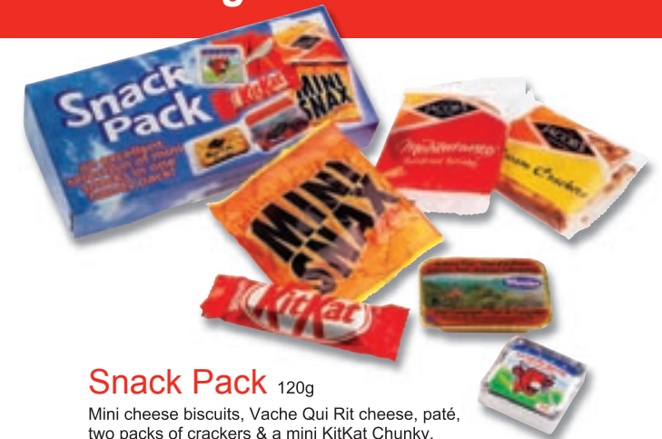
Snack Pack 120g Mini cheese biscuits, Vache Qui Rit cheese, pâté, two packs of crackers & a mini KitKat Chunky. £2.70 • €4.50 • CHF6.50