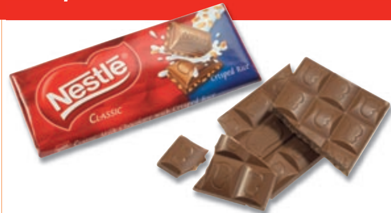
Nestle Milk Chocolate Bar 90g new Nestle Milk Chocolate with Crisped Rice. £1.00 • €1.50 • CHF2.50

Mark Pugh-Williams - Senior Cabin Crew, Luton Airport