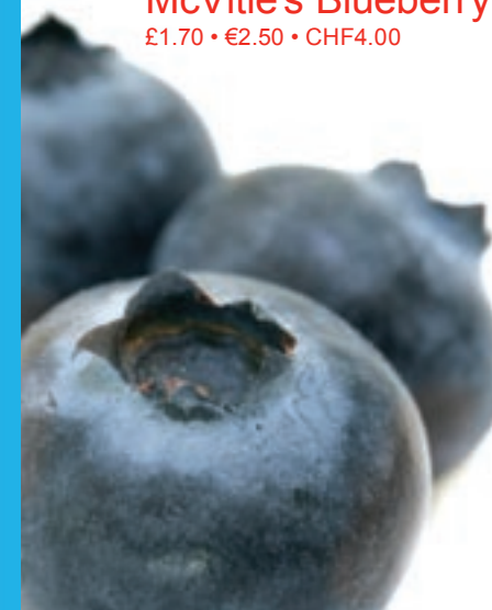
McVitie's Blueberry Muffin 95g £1.70 • €2.50 • CHF4.00