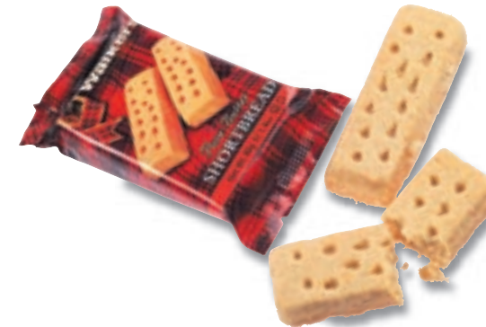
Walkers Twin Finger Shortbread 40g £0.70 • €1.00 • CHF1.50