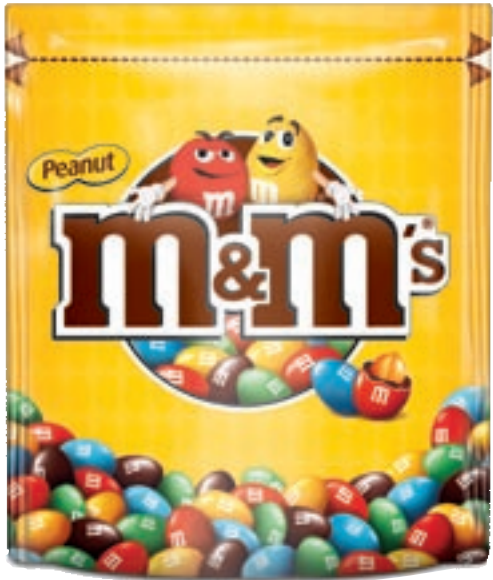
M&M Peanut Bag 250g new £2.10 • €3.00 • CHF5.00