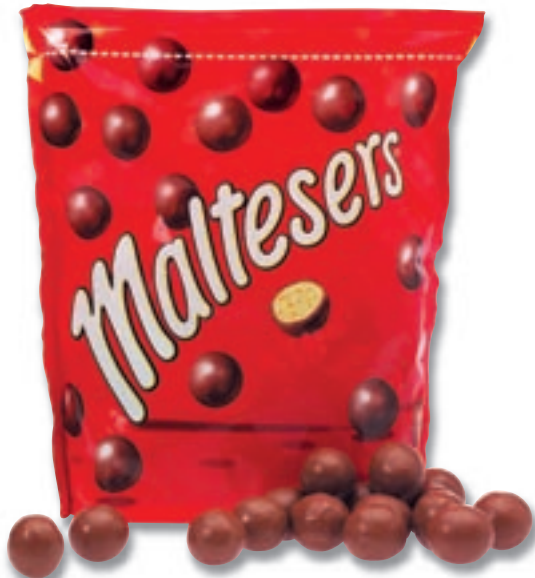
Maltesers Share Bag 175g £2.10 • €3.00 • CHF5.00