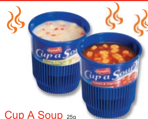
Cup A Soup 25g Chicken and Vegetable with croutons. Tomato and Vegetable with croutons. £2.10 • €3.00 • CHF5.00