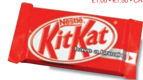
Kit Kat Four Fingers 48g £1.00 • €1.50 • CHF2.50