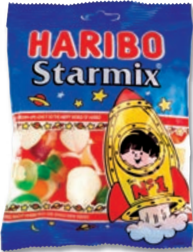
Haribo Starmix Bag 225g £2.10 • €3.00 • CHF5.00