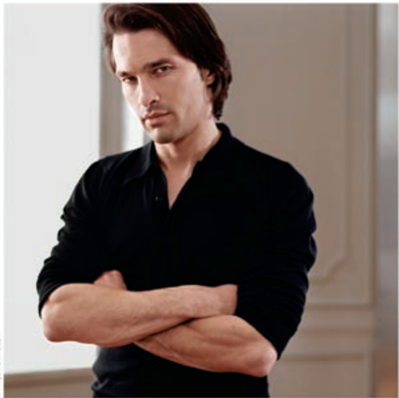
Olivier Martinez by Sam Taylor-Wood

£26.50 • €40.50 • CHF65.00 RRP £33.00 • SAVE £6.50