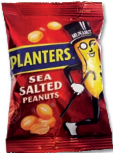
Planters 50g Salted Peanuts £1.00 • €1.50 • CHF2.50